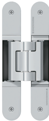
e.g. TE 540 3D FR