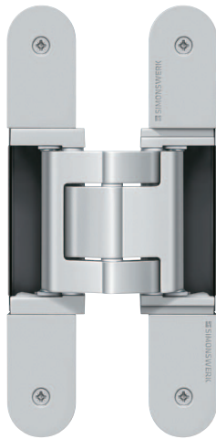
e.g. TE 540 3DA8