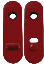
0524 28 Bathroom 78mm centres