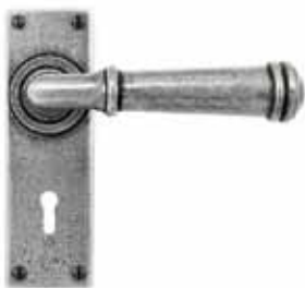
FD005 Durham lock furniture 145mm x 45mm backplate

These products are neither plated nor laquered, but cast in solid pewter and made in England.