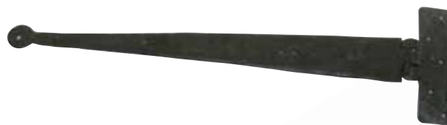
Scotch Pattern Tee Hinge